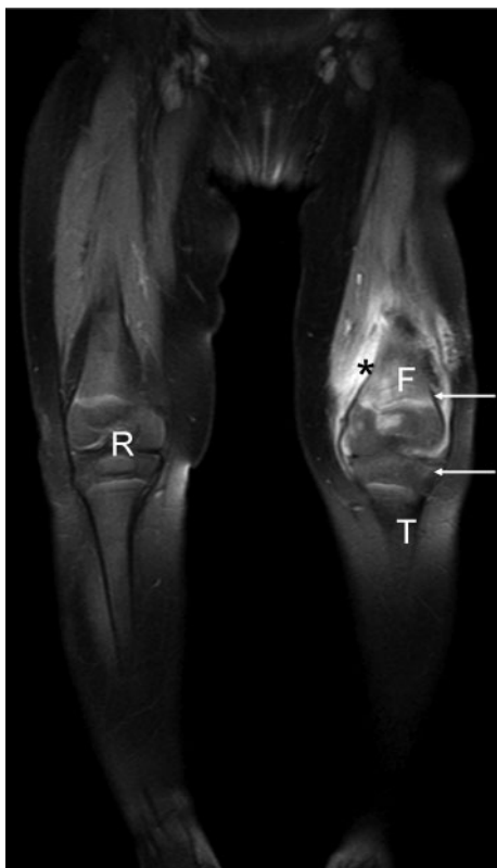
Fig. 2. Coronal MRI (T1 TSE) with contrast medium (gadolinium DTPA) of both lower extremities after 30 days. Compared with the completely normal right knee (R), synovial (asterisk) and osseous (arrows) enhancement of the left knee is seen. F, Femur; T, tibia.

was recommended (Pappas et al. , 2004). The more recent guidelines of 2009 for the treatment of candidaemia and Candida osteoarticular infections allow starting therapy directly with fluconazole (6 mg kg -1 twice daily) in addition to the older guidelines (Pappas et al. , 2004, 2009).