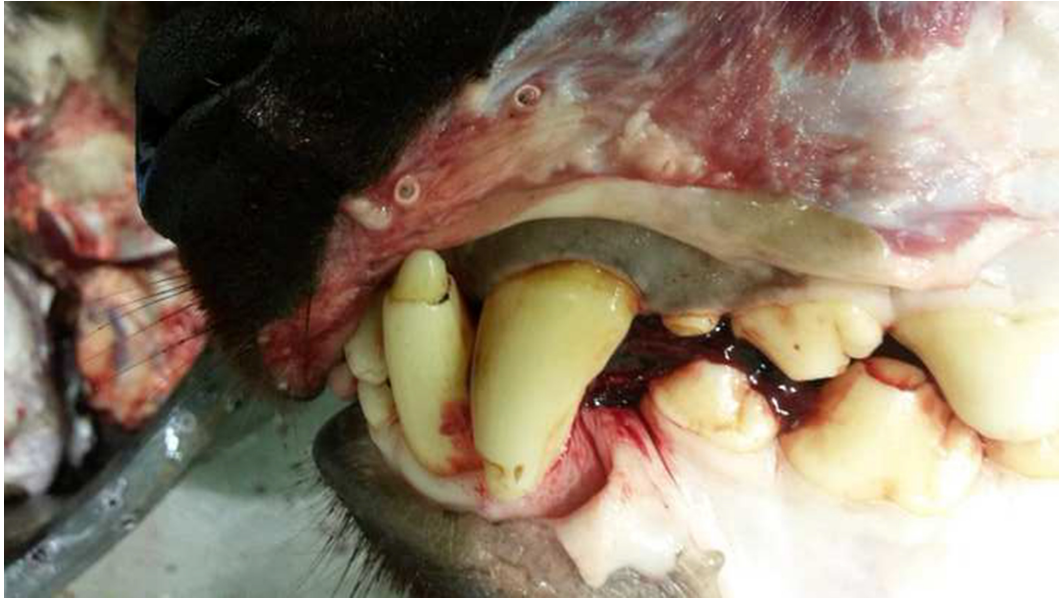
Fig. 2. Teeth of a brown hyena ( Hyaena brunnea ) that died of CDV showing enamel hypoplasia due to presumed prior infection as a juvenile.

disease within 2–3 weeks. Signs are progressive and varied depending on the area of the brain affected but commonly include abnormal behaviour, convulsions or seizures, chewing-gum movements of the mouth, blindness, cerebellar and vestibular signs, paresis or paralysis, incoordination and circling [54, 72]. Infection in the central nervous system results in acute demyelination, and most animals die 2–4 weeks after infection [71, 73]. Due to the immune compromising nature of CDV, clinical signs are often exacerbated by secondary bacterial infections of the skin and respiratory tract [53].