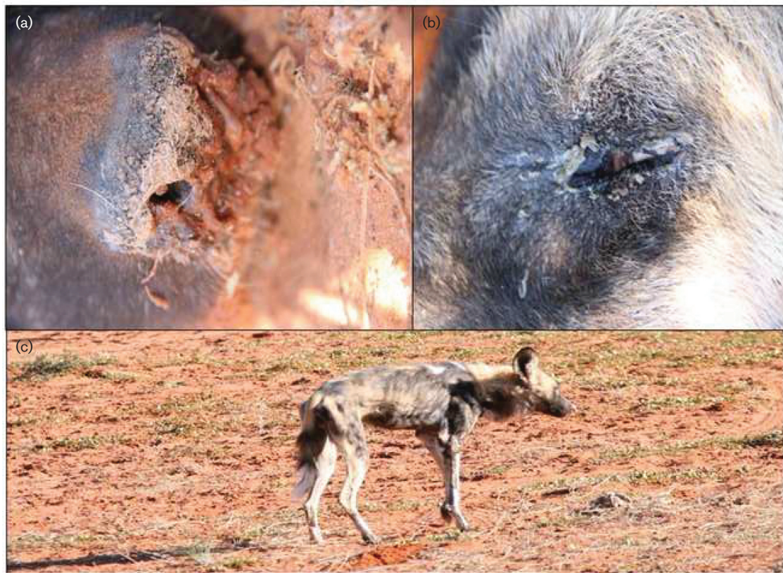
Fig. 3. African wild dog ( Lycaon pictus ) afflicted by CDV showing clinical signs of mucopurulent oculonasal discharge (a, b) and weight loss (c).

identified by site-directed mutagenesis to interact with SLAM [91, 92]. Two other residues at amino acid sites 530 and 549 have also been studied, and it is thought that these are important determinants of infectivity in carnivores. Both 530 and 549 fall into the receptor-binding domain located on propeller \beta -sheet 5 of CDV-H protein [88]. Previously suggested to be an adaptation of CDV to non-domestic dog hosts [88], residues at site 530 have subsequently been shown as generally conserved within CDV lineages regardless of host species [89]. Positive selection at site 549 of CDV-H and the specific substitution of tyrosine (Y) by histidine (H) is thought to have contributed to the spread of CDV from dog to non-dog host species [88]. The majority of CDV strains isolated from Canidae have Y at site 549, whereas CDV strains from other carnivore families mostly have H [93]. Studies on the impact of specific amino acid substitutions within the H protein are, however, speculative and several other factors could also have contributed to the spread of CDV. Conversely, when comparing the amino acid sequences of the entire H binding site in SLAM among various carnivores, a high similarity among residues from Canidae species was found, suggesting a similar sensitivity to CDV among animals in this group [89]. In contrast, comparing Felidae to Canidae,