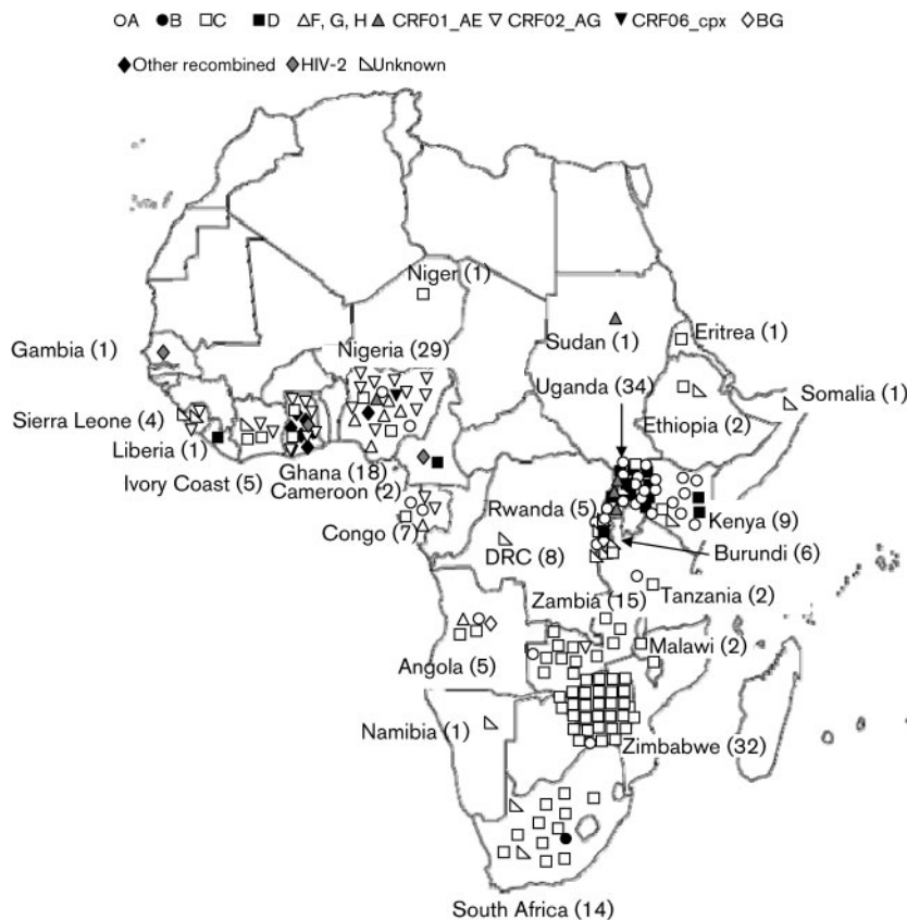
Fig. 1. The clade diversity of the African East London HIV-1 cohort. Numbers in parentheses are the numbers of patients sampled who were born in that country. Each symbol represents one patient.

cpx and some recombinants) are not discussed in detail. Only 160 infections (clades A, B, C, D, G, CRF01_AE and CRF02_AG were significantly represented; Table 2) were included for analysis.